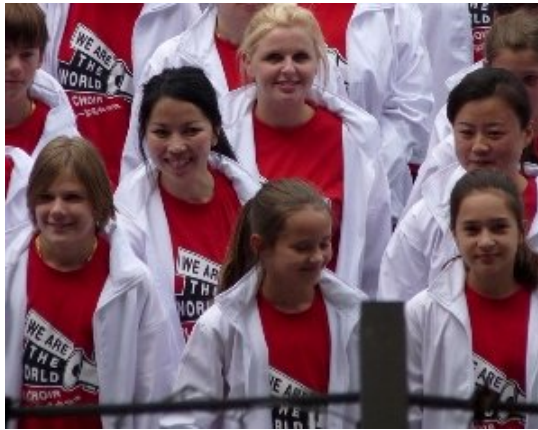
WISS singers at the Formula One Grand Prix in Shanghai.

The race was “a once in a lifetime chance, and really exciting,” a WISS student said. Another student was quoted