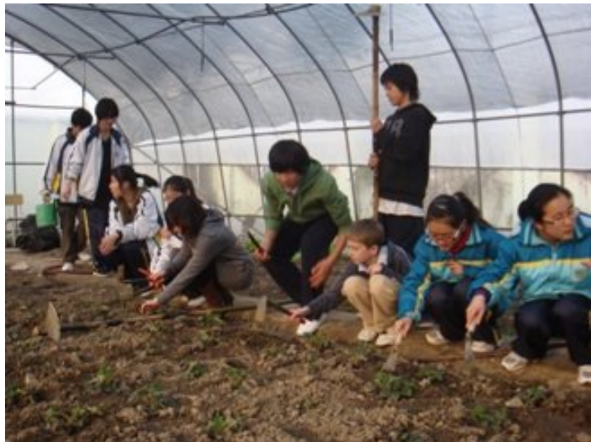
WISS students work with Qingpu senior high school students in their organic garden.

Roots and Shoots is an international youth community service organization that encourages young people to identify problems in their communities and empowers them to seek change.