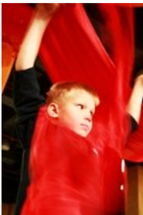
Chinese New Year Show