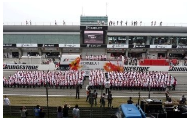
WISS and BISS students perform at the F1 race on April 18.