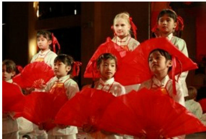
Grade One performs a fan dance at the Chinese New Year show.

with options it will be more open for students, allowing them to choose a path that they wish to follow instead of a path that is chosen by the school. This is the most intriguing part of the program and hopefully its goals will be realized.